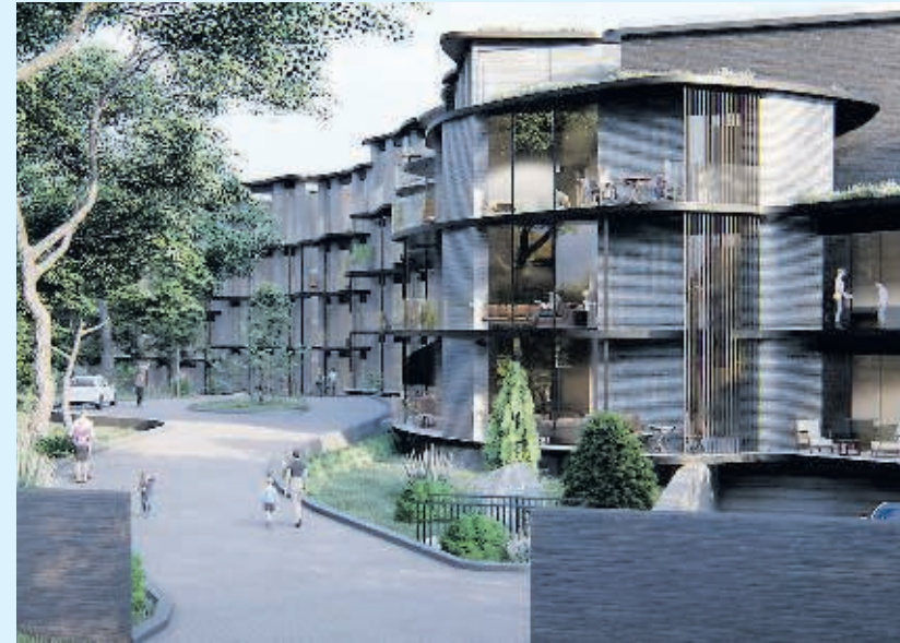
A planning application is in for 101 apartments on Castle Park Road in Dalkey

Vanguard Health Services has been granted planning permission for a €50 million hospital/health centre development in Swords in north Co Dublin. The development will consist of an eight-storey facility comprising