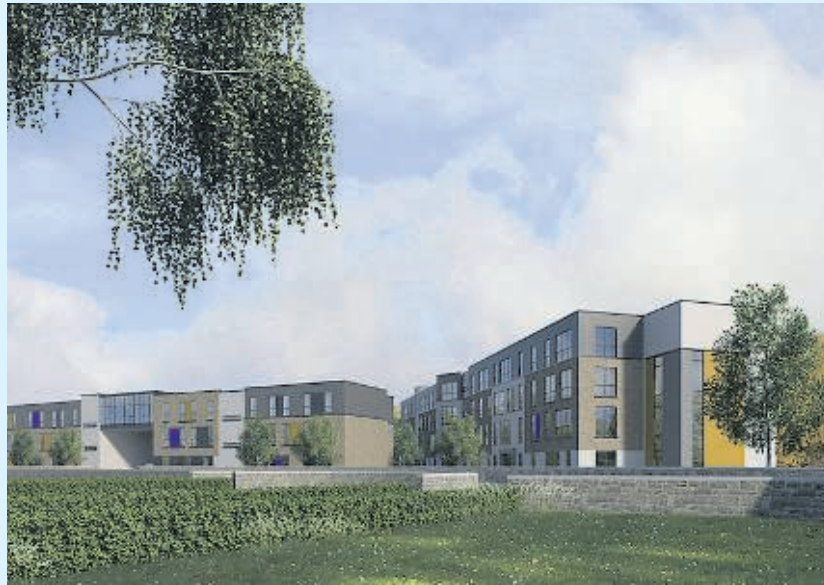
Student accommodation is planned for Coolough Road in Terryland, Co Galway

room, two-storey houses; roads, footpaths, underground services, drainage systems, car parking, boundary treatments, landscaping, open spaces, connection to existing sewers and water main and all associated site works.