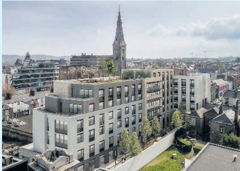
Computer-generated image of a proposed co-living scheme in Dún Laoghaire

A Part 8 application (those used by county councils to apply for planning permission) is in a consultation phase with Tipperary County Council for the construction of ten new houses comprising two two-bedroom, two-storey houses; eight three-bed-