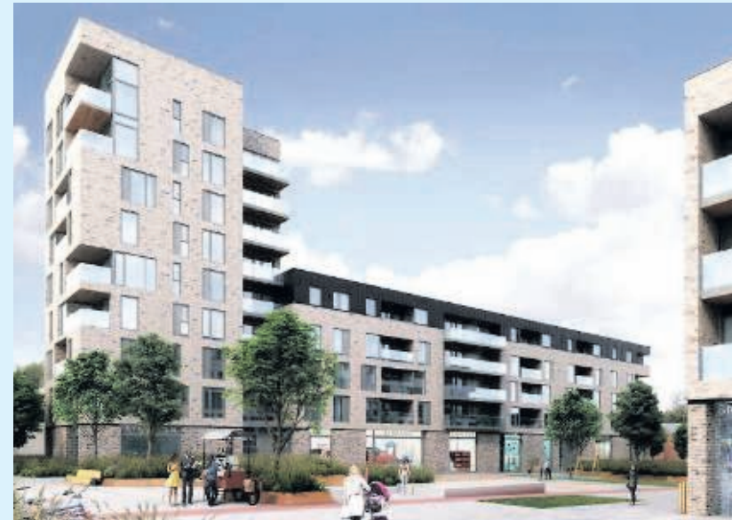
Planning permission has been granted for 488 apartments in Saggart

of a main entrance/reception area, atrium winter garden, a cafe, a restaurant, two retail units, outpatients and diagnostics departments, GP departments and urgent care department all at ground floor level; out of hospital services/primary care at first and second floor levels; an endoscopy unit and theatres at third floor level; a theatre and building plant at fourth floor level; and another endoscopy