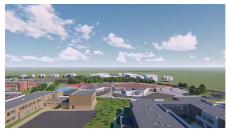
Strule Shared Educational Campus in Omagh

The Department of Education originally proposed the construction of 5 core school buildings, shared facilities, sports pitches, associated ancillary accommodation, cycle parking areas, car and bus parking areas, associated site preparation and ancillary works and access points to Gortin Road and Strathroy Road. Arvalee Special School has been completed as part of this overall project. Full Project details here