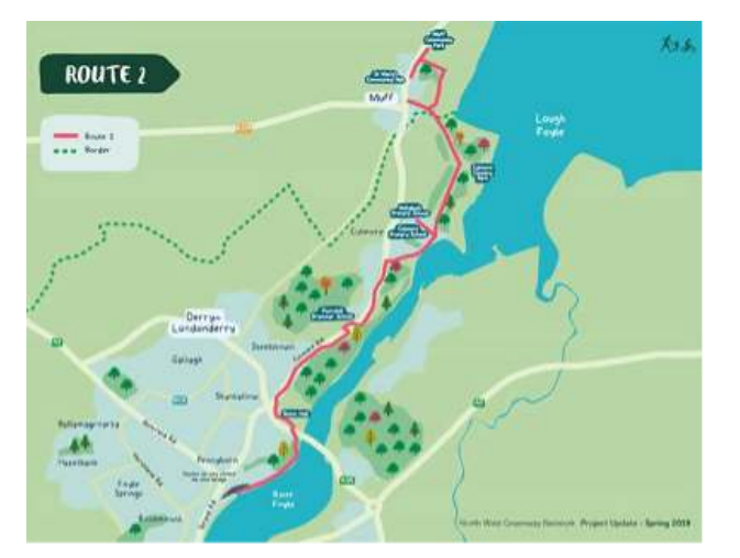
The North West Greenway Network (Derry to Muff, Route 2)

Another project is for the Strule Shared Educational Campus in Omagh. A new market engagement exercise is taking place before the submission of a formal tender as the estimated cost of the project has risen substantially to £213 million since it was first announced in 2016. The Strule campus is the biggest school building project in Northern Ireland.