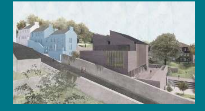
€12.5m School Development, CBC, Sidney Hill, Co. Cork.

Boyle Construction has commenced work on a €6.4m School Development at Scoil Mhuire, Stranorlar, Co. Donegal.