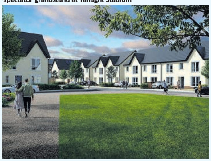
Some 426 residential units are to be built on land within the