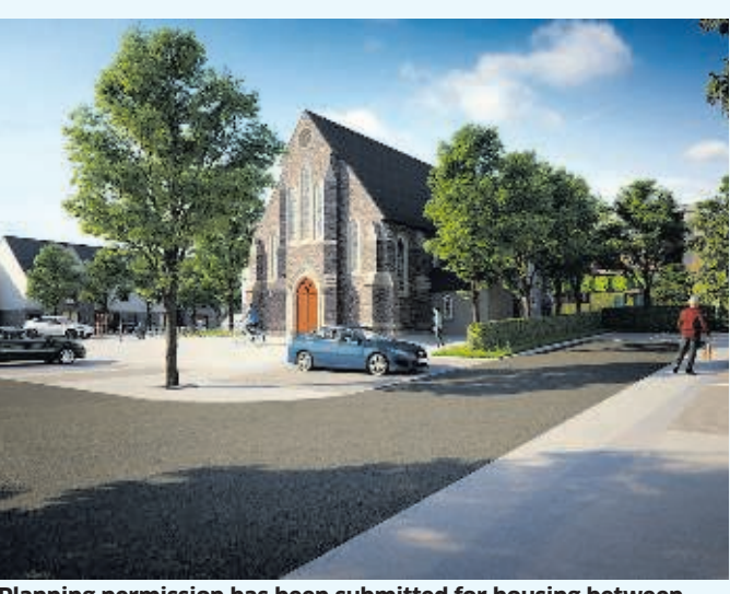
Planning permission has been submitted for housing between Convent Road and Bellevue Hill in Delgany, Co Wicklow

These will have a cumulative gross floor area of 31,117 square metres for the residential component comprising 404 apartments in four blocks ranging in height from two