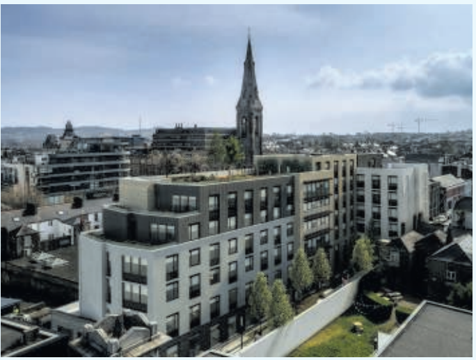
Work has started on the Bartra shared living development at

Tenders have been issued to contractors for works on a new spectator grandstand at Tallaght Stadium in