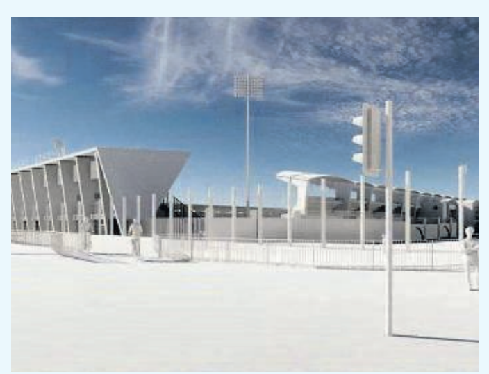
Tenders have been issued to contractors for works on a new spectator grandstand at Tallaght Stadium